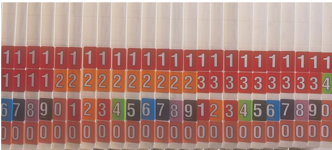
All the numbers you need for super-accurate filing of numerical records.

L ook how effectively the system works! The minute you put a file in the wrong spot, your eye lets you know...no more searching for a file that should be in one place, but is hiding somewhere else! Because each file is unique and works within the colour band, you'll know the minute one is out of place!