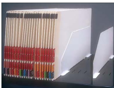
A variety of file supports available

Based on a FileQuest 7-level Flipper door cabinet