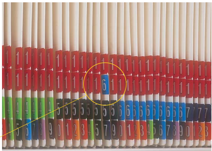
Whoops! A misfile? But not for long.

L ook how effectively the system works! The minute you put a file in the wrong spot, your eye lets you know...no more searching for a file that should be in one place, but is hiding somewhere else! Because each file is unique and works within the colour band, you'll know the minute one is out of place!