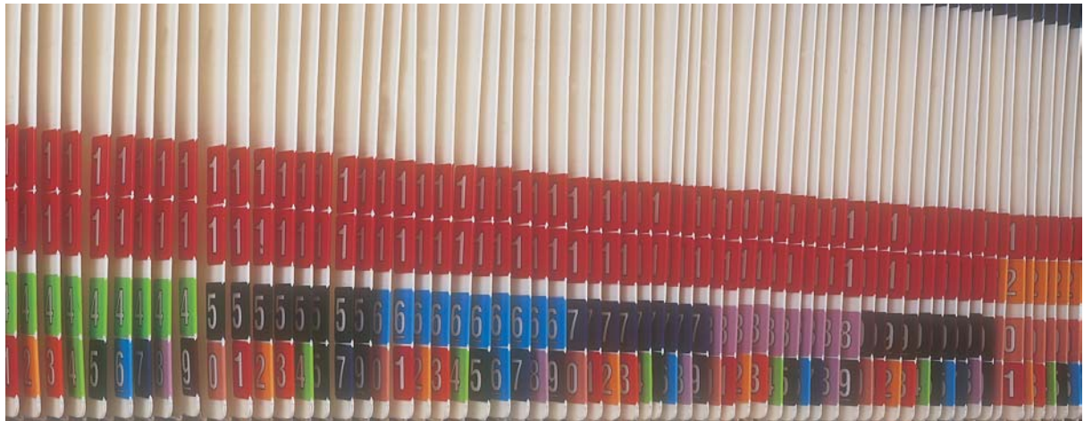
At a glance colour coding remains the key for both numerical and alphabetical references.