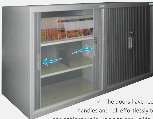
< The doors have recessed ergonomic handles and roll effortlessly to the side, within the cabinet walls using an easy-slide door mechanism