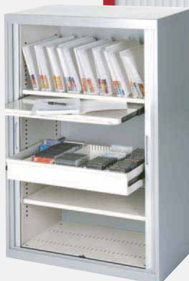
< A full range of filing accessories are available

> Tambour cabinets are available in a range of colours, with clear or coloured PVC door (or Aluminium door options - pictured)